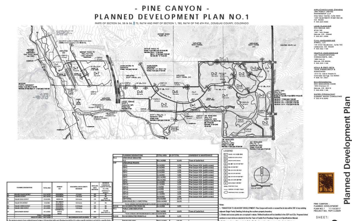
Pine Canyon - Proposed PD Plan